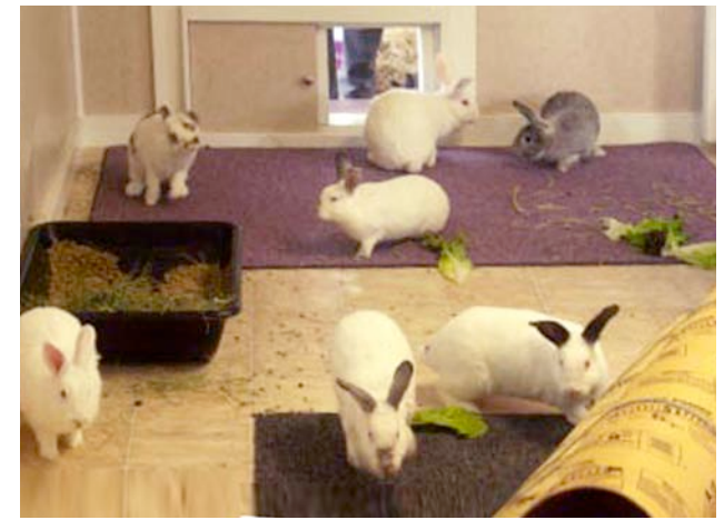
Rabbits enjoying their own happy hour at Harvest Home